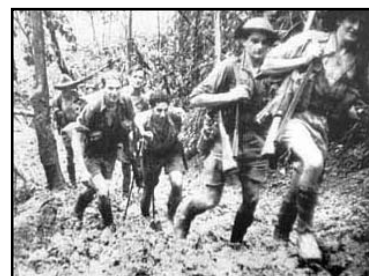
Photo taken by Old Boy Damien Parer of Australians on the Kokoda Track in 1942, New Guinea.